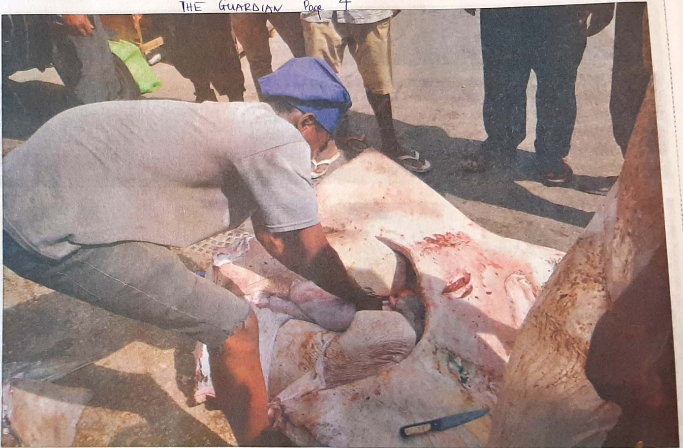
HUGE CATCH: A fisherman prepares a shark for sale at Darajani market in Zanzibar yesterday.

home remains a ite millions earned ndustry. However, on the driveway nirs earned from